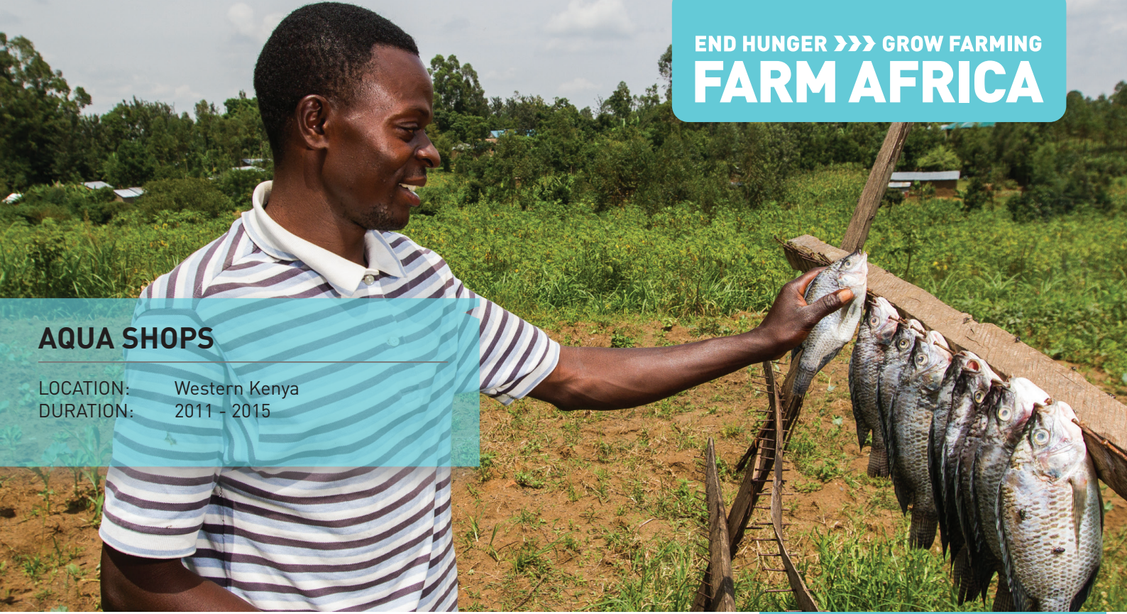
A tilapia fish farmer, Kenya

LOCATION: Western Kenya DURATION: 2011 - 2015