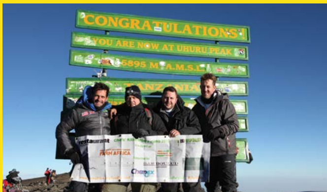
The chefs at the summit of Mount Kilimanjaro. Tanzania, August 2013

Just as important has been the commitment of employees from a wide range of food and hospitality companies. From organising high-profile fundraising balls to shaving heads and from running marathons to swimming for miles, we have been overwhelmed by the determination of people in the sector to play their part in this important campaign.